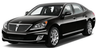
Hyundai Centennial (Limousine)